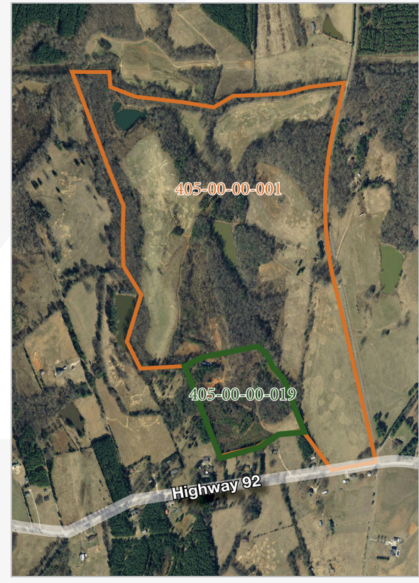
For more information